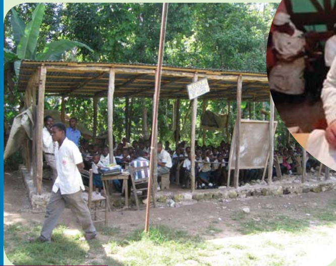
The outdoor school in Pichon.