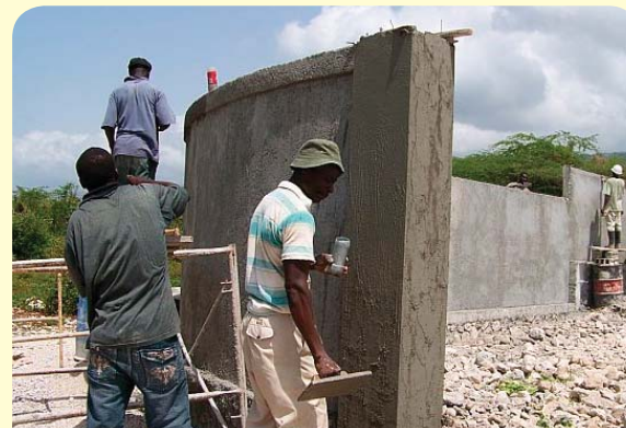
Workers completing wall for school play ground.

HERO receives many requests directly from communities to build schools, clinics and water systems. These are communities that are not fortunate enough to have sponsors from the United States or Canada. HERO continues to work to find funding sources to deliver these schools and water systems. We need your help in achieving our goal to build 100 schools with a well for each.