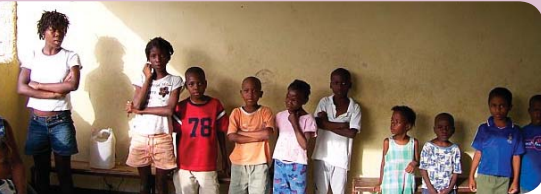
Children of Jesus Orphanage.