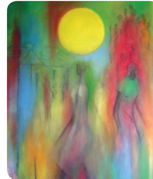
JONAS ALLEN, THE MOON

On September 6, 2008, HERO will host its first art sale benefiting the children of Haiti to provide them with clean water.