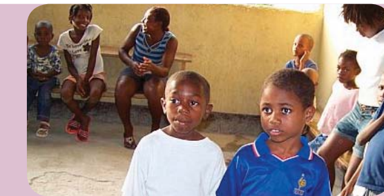
Daniel's Orphanage located on the outskirts of Port au Prince.

difficult time because my father died before I was born. My mother could not afford food, school, and other facilities for us. I had to wake up at 4:30 in the morning and go for water that was about three miles away from the house. I hauled big buckets of 5 gallons and had to make three trips before school. We also had to clean the yard, the house and other work such as helping the small children to get ready. We received an education from other people. Today, we